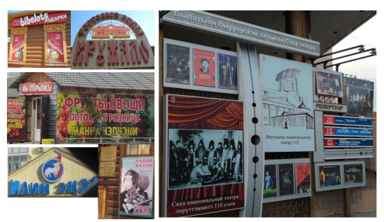
Figure 5. The LL of Yakutsk: some French, some Russian Ustav, and the national Yakut language.

same sign plate or on two plates near each other (there may also be two signs on either side of the entrance); not all of the information is duplicated. The Udmurt precedes the Russian or vice versa. Numerous shops and public transport stations have signs in two languages; unfortunately, we have no statistical information on this (see Fig. 6). In effect, difficulties are experienced when trying to apply bilingualism in practice in the public sphere [Torokhova 2012].