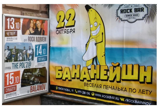
Figure 3. Different tendencies in a bar advertisement in Nizhny Novgorod: Rock Bar Since 2000; Rock вдвоем; THE POL'Z@;

Since 2000; Коск вдвоем; IHE POL Z@; BALANOV; Бананейшн Веселая печалька по лету. A bananeishn, or bananation, is a party where people are dressed and behave in a summery manner.