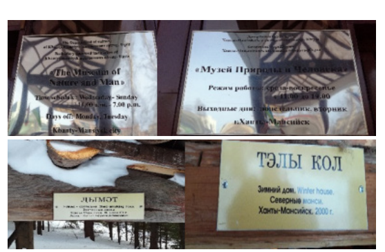
Figure 9. In Khanty-Mansijsk, the modern museum has inscriptions in Russian and English only. Words in the local languages can be found in the ethnographic park.