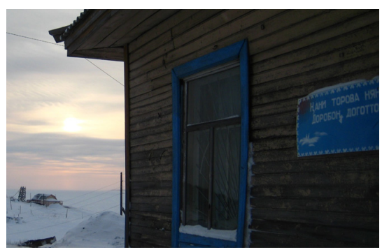
Figure 11. In the village of Potapovo on the Taymyr Peninsula, a non-Russian inscription appears in the Nenets language (on the side of the local shop).

omy all over the world. The distance between Moscow and Kazan is about 825 kilometres. According to the Law "On the Languages of Peoples of the Tatarstan Republic" (1992), both languages, Tatar (Turkic) and Russian, have the status of state languages and enjoy equal rights; still, only about 50% of Tatars (about 3.7 million) can speak the local language fluently [Graney 2010]. Rychkov and Rychkova [2012] have studied ethnolinguistically loaded landscapes of the capital, where similar information is provided in Russian, Tatar, and English, or in a combination of all three. In addition, other languages may be used in the streets and in the mass media. Beyond the central streets, the LL is more like everywhere else in Russia, with the exception of a few inscriptions in the Tatar language and names of Tatar origin. In November 2018, in one of the main areas, Bauman pedestrian street in a segment about 1,000 steps long, about 60% of the advertisements and signs were in Russian, 30% in international English, and 10% in Tatar (Fig. 12). Aristova [2016] also demonstrated that in the LL in Tatarstan English predominates over the local language, Tatar.