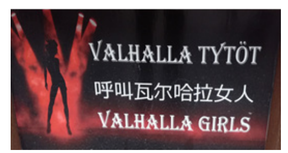
Figure 2. In St. Petersburg, one inscription was in Finnish, Chinese and English without any Russian. This could indicate that the information is intended for foreigners only and that the most common tourist groups speak these languages.

literates DANCE & GRILL as ДЭНС & ГРИЛЬ. The MЯSOET Meat Company (myasoet.ru) includes restaurants with Turkish cuisine; the name plays with Cyrillic and Roman letters and combines the words 'meat' in Russian and Turkish; when pronounced, it sounds like the Russian word 'meat-eater' (in the written form, it could indicate a mistake). The name of the chain ШашлыкоFF continues the line where the nominals refer to Russian family names abroad. The names of visiting musical groups remain unchanged (Figs. 2, 3).