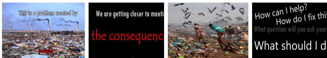
Picture 3. Digital story with the topic

“Ask not, what your country can do for you. Ask what, you can do for your country”